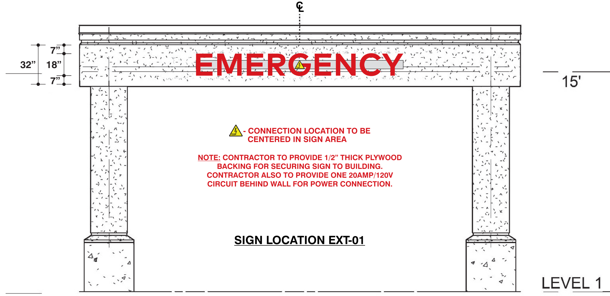
C ELEVATION DETAIL - EMERGENCY DEPARTMENT CANOPY @ ENTRANCE - SIGN LOCATION - EXT-01 SCALE: 1/4" - 1'-0"