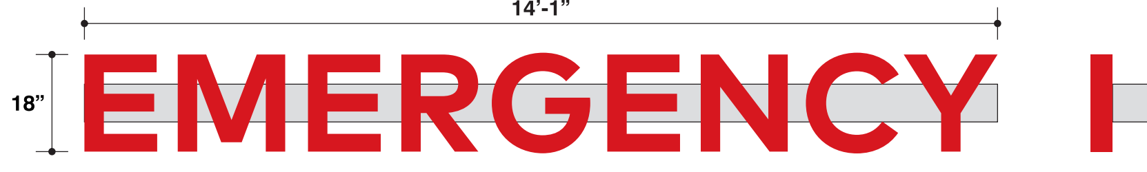
D ELEVATION DETAIL - SIGN TYPE EXT-A - INTERNALLY ILLUMINATED CHANNEL LETTERS, RACEWAY MOUNTED SCALE: 1/2" - 1'-0"

NOTE: TEXT T4; FABRICATED CHANNEL LETTERS WITH ACRYLIC FACES AND PAINTED RETURNS; INTERNALLY ILLUMINATED WITH LEDS AS REQUIRED FOR SUFFICIENT ILLUMINATION AND NO HOTS SPOTS. COORDINATE LOCATION OF REQUIRED POWER AND ANY BLOCKING WITH GC; FINAL ELECTRICAL CONNECTION OF SIGN TO POWER BY SIGN CONTRACTOR/INSTALLER; RACEWAY PAINTED TO MATCH SCHEDULED MOUNTING SURFACE.